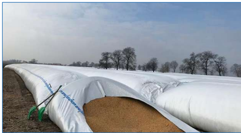
Fig. 4. Polyethylene sleeve storage

Grain “sleeves” are three-layer polymer bags 60-75 m long and with a capacity of 65-300 tons, which are filled with grain by a special grain packaging machine - a bagger (AG BAG). The hoses are made using a special additive - metallocin (mLL), which gives the hose material the greatest strength and elasticity. The structure of the sleeve material is three-layer. The three layers are inseparable; each layer is made from different polymers with different additives and stabilizers. Ultraviolet additives in the material of the sleeves prevent the harmful effects of the UV spectrum on stored products. Advantages: allows you to avoid the process of forced stoppage of harvesting, which often occurs due to the lack of free space on the currents, storage of dry grain or grain with high humidity; no need to transport grain to the elevator; release of automobile and other agricultural equipment; storage of sorted grain and so on. Disadvantages: probability of damage during storage of seed material by products of anaerobic activity; short hose life (Figure 4).