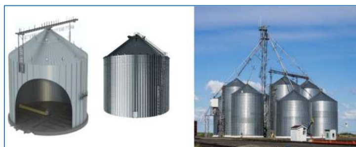
Fig. 3. Metal silos storage

Metal silos are a more mobile and easier-to-install structure than concrete elevators. Silo bodies are made of steel, aluminum or alloys. The base of such granaries can be either conical or horizontal. In the latter case, the procedure for