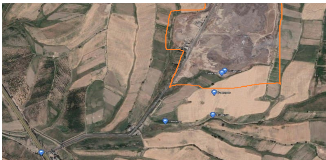
Fig. 1. Space image of the investigated area.

Soil samples for research were selected according to the following coordinates (Fig. 2): (41°05'32.5"N / 69°28'48.8"E, 41°05'31.9"N / 69°28'48.0"E, 41°05'26.7"N / 69°28'45.8"E, 41°05'20.7"N / 69°28'45.4"E, 41°05'19.0"N / 69°28'31.8"E, 41°05'32.5"N / 69°28'48.8"E, 41°05'32.5"N / 69°28'48.8"E, 41°08'15.0"N / 69°26'35.0"E, 41°10'13.6"N / 69°24'49.0"E.).